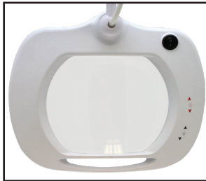
7.5" x 6.2" / 3-Diopter Lens 1.75x Magnification

Covered Spring Balanced Arm No Pinch Hazards