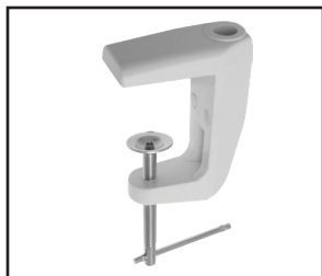
Heavy Duty Mounting Clamp